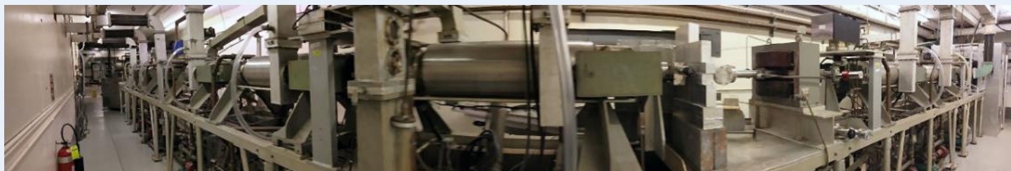
The Gaertner LINAC Facility http://www.linac.rpi.edu

For more on Troy NY, and the NY Capital Region visit: https://admissions.rpi.edu/enjoy-troy