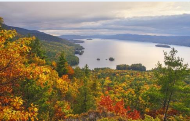
Lake George, NY (1 hr drive)