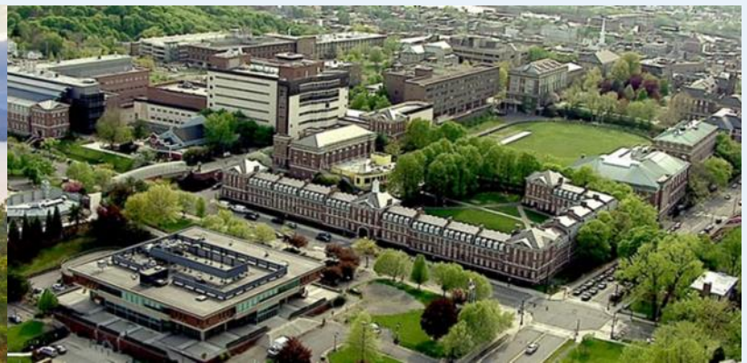
Rensselaer Polytechnic Institute